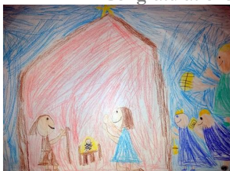
Age 5-7 - Finian