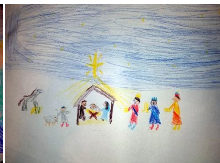
Age 8-10 - Luka