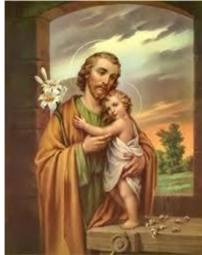
Viva San Giuseppe

The Church of the Incarnation Knights of Columbus Council 15199 and Assembly 3309 invites members and families to our first annual Saint Joseph's Table.